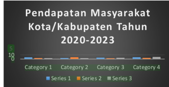
Figure 3. City/Regency Community Income for 2020-2023

City/district community income refers to the total income received by residents of the city or district from various sources, such as salaries, dividends, or income from business. This is an important indicator in assessing the level of economic prosperity of a region. High levels of community income tend to have a positive impact on the quality of life of the population, including access to better health and education services as well as greater economic opportunities. It also reflects economic growth and sustainable development within a city or district.